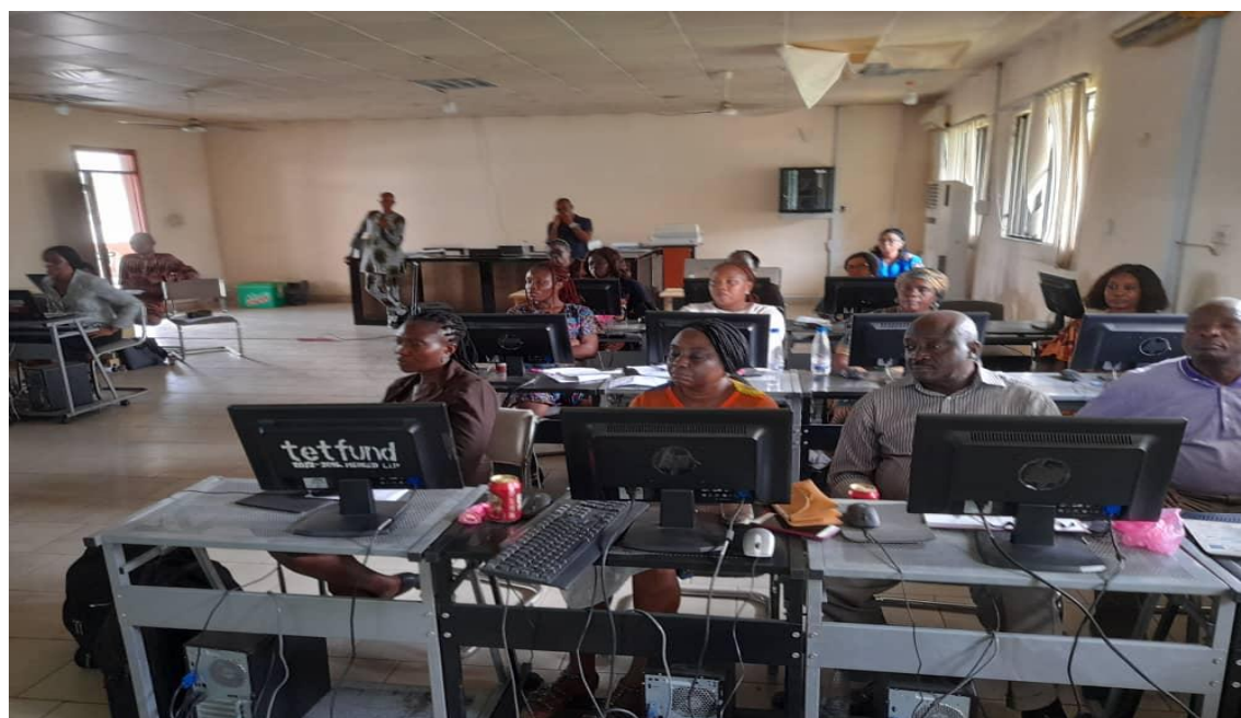
Cross section of training in progress