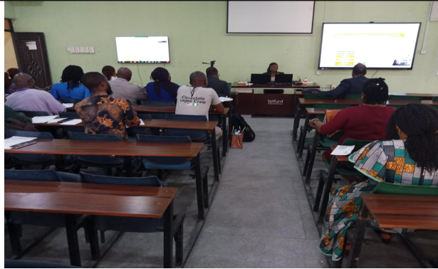
Some cross section of participants