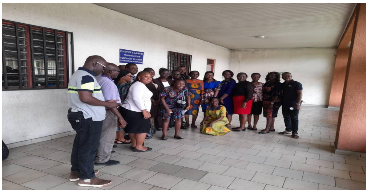
General Group Photo after Training