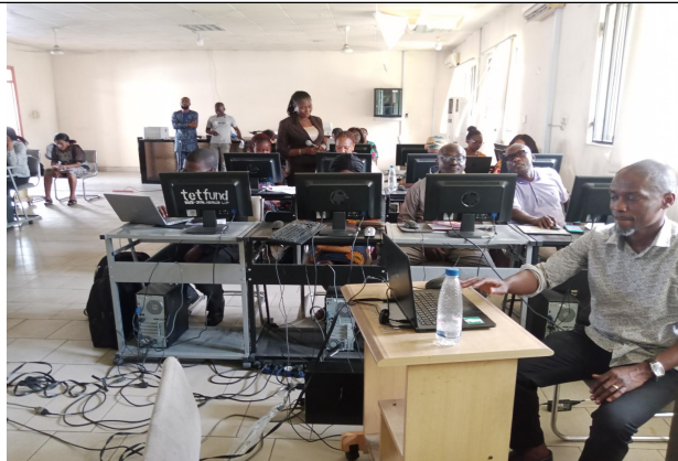
Practical Section during the training