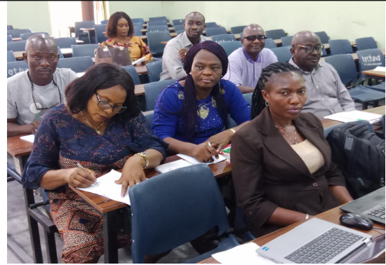
One of the Resource persons in front of another cross section of participants