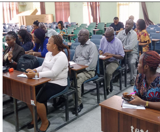
Some cross section of participants